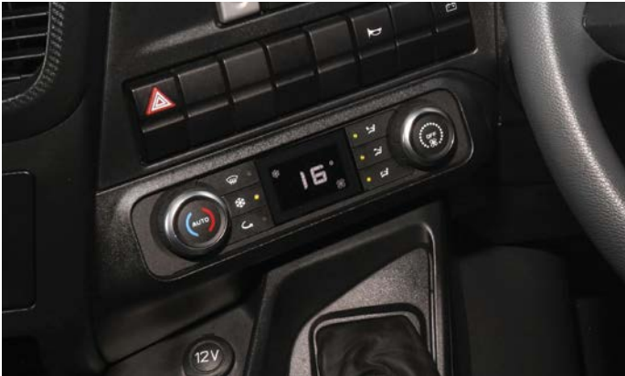
Auto a/c system