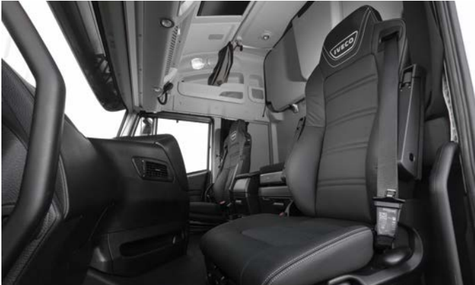
Stralis X-Way AS-L Prime Mover interior