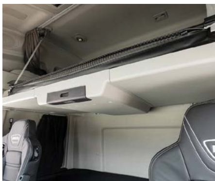
Stralis X-Way sleeper cab interior