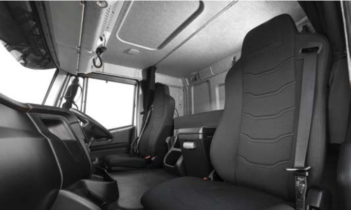
Stralis X-Way AT Prime Mover interior