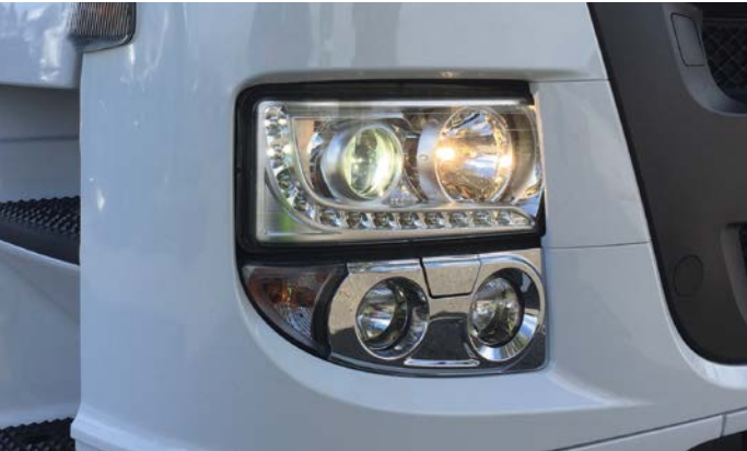
Xenon headlight + Headlamp washers