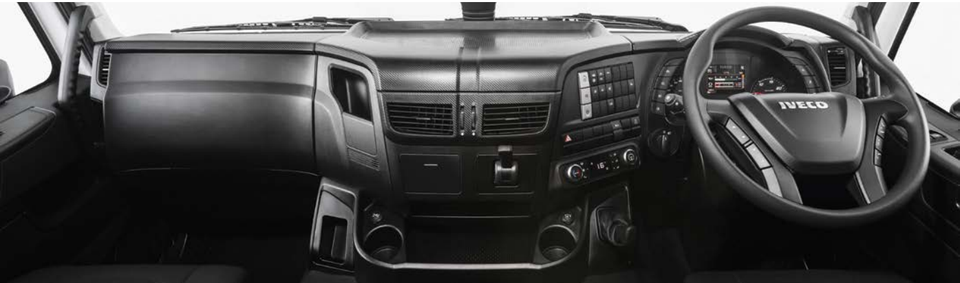
Stralis X-Way AT Prime Mover dash