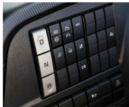
Stralis X-Way dash