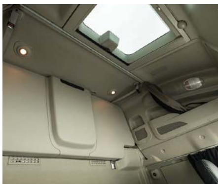
Stralis X-Way sleeper cab interior